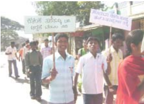
World AIDS Day Observed by Kannada Jagruthi Samithi, Govt. PU College NSS Unit, KHPT, DAPCU & other Associations.