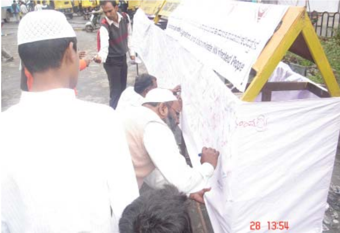
People expressing their solidarity by participating in the signature campaign

Three collectives of female sex workers in Bangalore Urban come together. Swathi, Vijaya & Jyothi Mahila Sangha organized the launch of Project Baduku which, they hope, will be a new voice of the sex workers and PLHIV to address issues of violence, stigma and discrimination. The program focuses on advocacy with police, goondas, lawyers, pimps, doctors and other service providers. It also envisages seeking the support of the media to maximize its advocacy efforts for the upliftment of the marginalized and stigmatized populations.