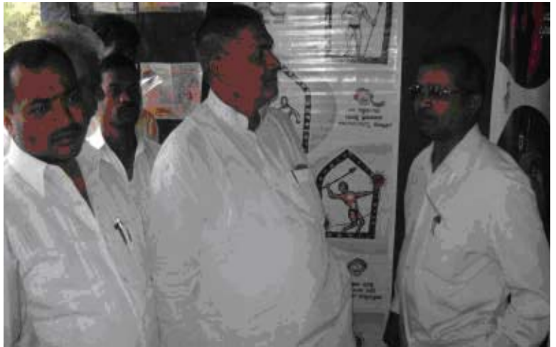
The ministers inaugurate the Kiosk during the week long program.