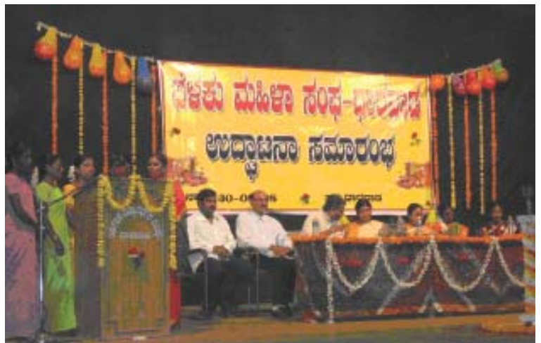
Community women participate in the proceedings of the inaugural function