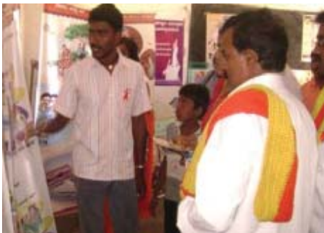
The Channagiri Taluk Team imparting the information centre.