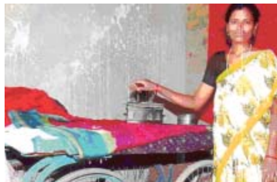
Some of the women who benefited from the loans.