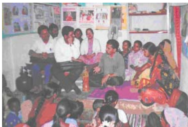
Mukha-mukhi with the doctor in progress

Once in three months, the Mukha – Mukhi program is organized to provide an opportunity for the FSWs to discuss their issues directly with the Doctors. It is a platform for the community to own their programme. During Mukha - Mukhi, they ask questions and clarify doubts regarding health and other related aspects directly with the doctor. The women also put forward their complaints. This direct communication between the women and the doctor in a non-clinic setting is very useful. This serves as an ice breaker between the doctor and the community women. Mutual accountability and mutual responsibility is fostered as a result of this. It helps the doctor change his preconceived notions about the FSWs community. This program has proved to be successful and many women share that it has helped motivate the women to attend clinics regularly.