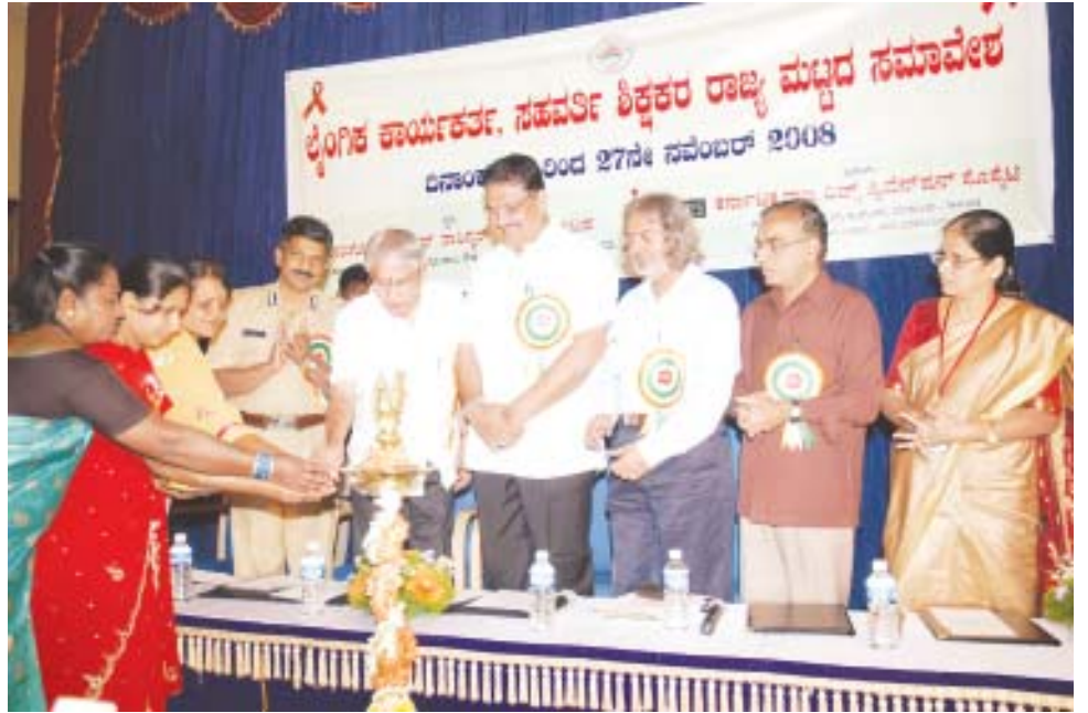
The peer convention declared open as community women light the lamp

A state level peer convention for 3 days was organised by KSAPS at Mysore with the main objectives of-