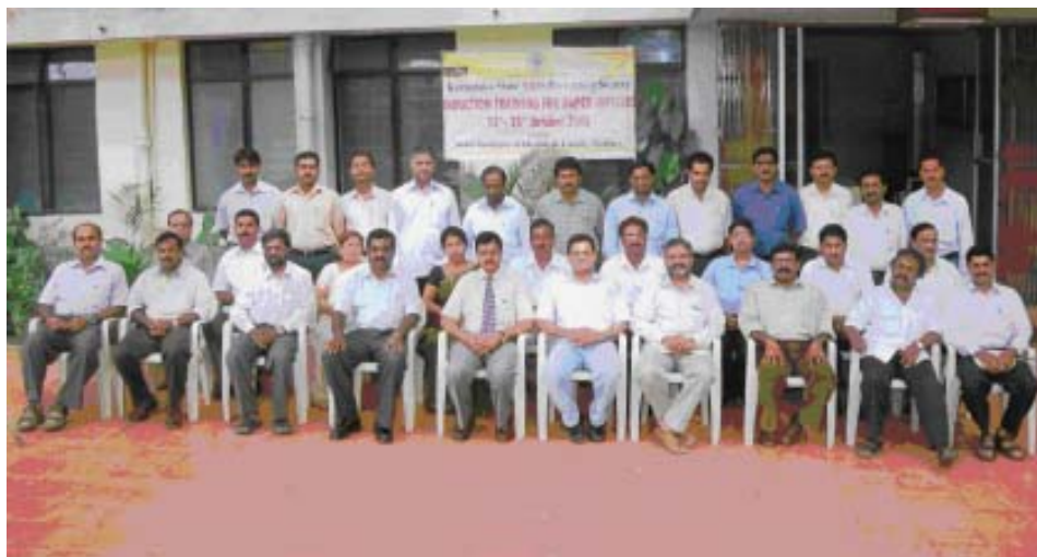
DAPCU Officers at the Induction training at State Institute of Health and Family Welfare (13 th – 25 th October 2008)

India is committed to the Millennium Development Goal of halting and reversing the HIV/AIDS epidemic in the country by 2012. The implementation of NACP-I (1992-99) and NACP-II (1999-2006) has resulted in institutionalization of efforts nationwide and there is encouraging evidence regarding its stabilization in some parts of the country.