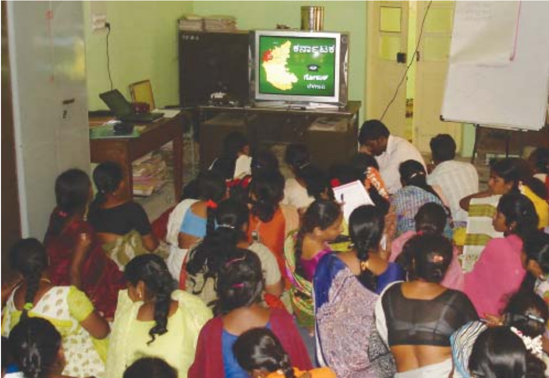
Seen are the women from MAPS at the receiving station at the Maddur Taluk panchayat Kendra engaging in discussions after a movie screening on violence.