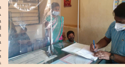
The paediatric TB screening camp at Belagavi

Belagavi is known to be one of the districts in Karnataka worst affected by malnutrition. A review of the TB patients by the BTB team in consultation with District TB Officer found that malnutrition is an issue in the intervention areas as well. The Shree Shakti Mahila Okkuta Sangh, a Self-Help Group in Ramdurg town, sought to address the issue. With support from the Anganwadi workers, the Sangh members put together a list of children suffering from malnutrition in their respective areas. A list of 32