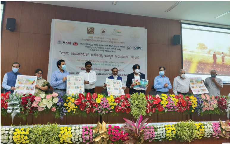
Shri K S Eshwarappa, Minister, RDPR and Shri L K Atheeq, Principal Secretary, RDPR launch IEC from the GP and vaccination campaign kits at Suvarna Soudha, Belagavi

KHPT staff are currently working in collaboration with Panchayat officials in 13 districts to operationalize the GPAA through the delivery and distribution of kits, orientation and training of Panchayat officials and handholding support for frontline workers.