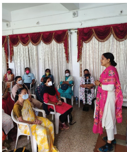
CHWs attending a motivation session