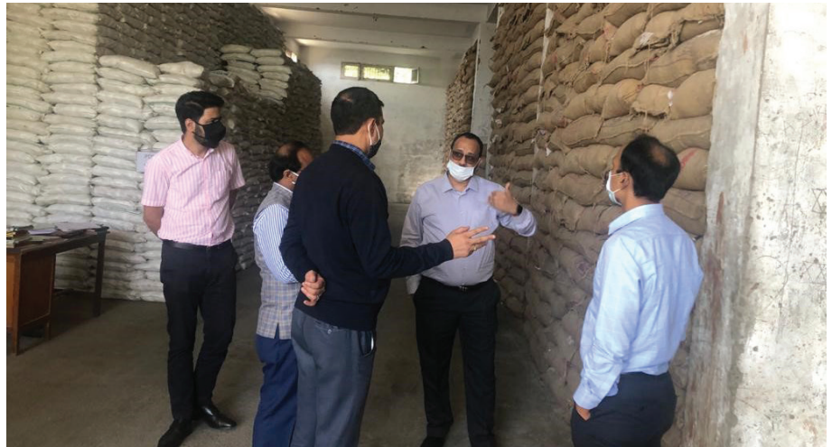
The MP team at a wheat flour mill in Solan district

Himachal Pradesh is one of the first states in the country to have fortified wheat flour distributed through its Public Distribution System (PDS); this process was supported by the technical assistance of KHPT-GAIN. The KHPT team facilitated the exposure visit of senior officials of the Department of Food, Civil Supplies and Consumer Protection, Government of Madhya Pradesh, and the Madhya Pradesh State Civil Supplies Corporation (MPSCSC), to Himachal Pradesh to learn about the implementation of fortified wheat flour distribution through PDS. The MP Government, with the technical support of KHPT-GAIN, is keen to pilot wheat flour fortification through PDS in some of the districts in Madhya Pradesh.