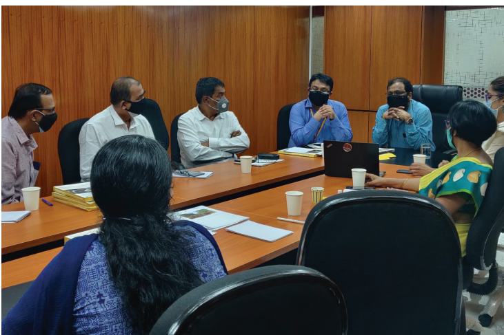
The KHPT team meets with the Central TB Division