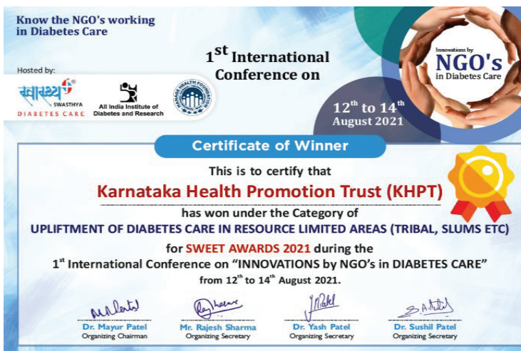
KHPT's certificate awarded for innovations in diabetes care

KHPT's patient-centric care model to manage diabetes and hypertension was recognized at the 1st International Conference on 'Innovations by NGO's in Diabetes Care. It won the Best NGO award under the 'Upliftment of Diabetes Care in Resource Limited areas (Tribal, slums, etc.)' category. The virtual conference was held in Ahmedabad from August 12-14. Participants from 31 countries, 249 cities of India and 687 NGOs across the world were part of the event.