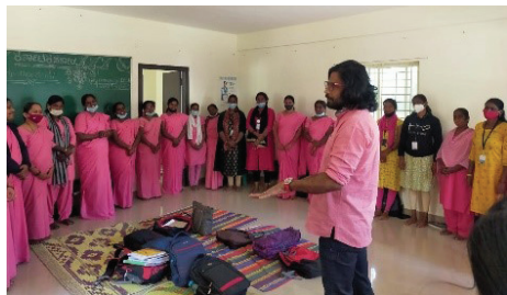
■ A group activity with ASHAs and CHWs

One of the key strategies of the Singasandra UPHC strengthening project is to build the capacity of ASHAs to do effective outreach and enable the MNCH continuum of care among vulnerable communities. The project recruited CHWs to mentor the ASHAs, and to perform the role of ASHAs in areas with vacancies and in vulnerable pockets which are currently not covered by ASHAs. To bring both the ASHAs and CHWs on the same platform, a half-day needs assessment meeting was held on December 24. The purpose of this meeting was to improve the trust, coordination