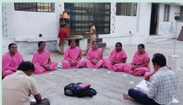
■ The FGDs with ASHAs in Kodaikal village

KHPT is conducting a qualitative study to understand facilitators and barriers to preconception nutrition in Surpur and Devadurga taluks of Yadgir and Raichur districts, respectively. As part of the study, ASHA workers were involved in a focus group discussion (FGD) in Kodaikal village, Yadgir, on November 13, to understand their perspectives towards the need for preconception care. Their views and attitudes towards the importance of good nutrition and care before pregnancy can determine the quality of service delivery.