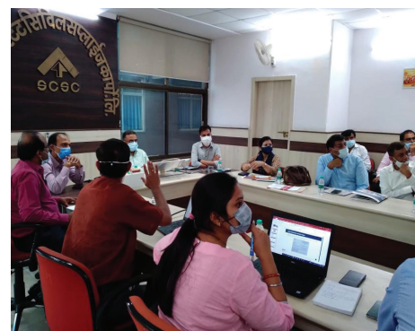
■ The KHPT team at the meeting on October 21

A state-level meeting on wheat flour fortification in Madhya Pradesh was held on October 21, chaired by the Principal Secretary, Food, Civil Supplies and Consumer Protection, Government of Madhya Pradesh, and attended by the Managing Director-MPSCSC, General Manager-MPSCSC, and representatives from roller flour millers to discuss the potential action plan and implementation model with roller flour millers, as well as the costing of wheat grain conversion to wheat flour. KHPT presented the findings from its assessment of sensory acceptability and cost conducted earlier