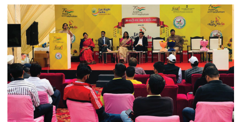
A KHPT team member presents at the Eat Right Mela in Karnal, Haryana

KHPT also conducted a cost comparison survey of local chakkis in rural and urban areas of Madhya Pradesh. The team found that the cost of grinding grains to flour ranged from Rs 1-3 per kilogram in rural areas and Rs. 2-4 in urban areas. Based on these costs, the Madhya Pradesh State Civil Supplies Corporation (MPSCSC) will decide the cost implications of converting grains into fortified wheat flour for distribution through safety net programs.