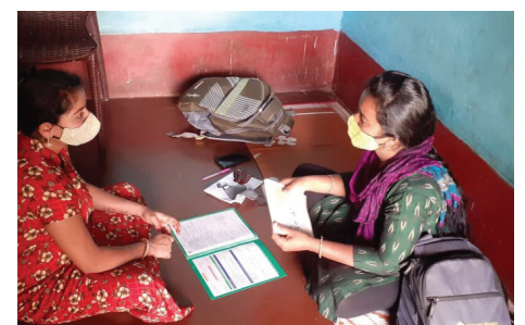
A BCC session conducted by the CHW in the community

The CHWs initiated BCC sessions at the community level for the MNCH target groups i.e. pregnant, lactating mothers, and children below the age of five years. The program team focused on strengthening the BCC skills of CHWs through the demonstration of materials in the field by the BCC Specialist. As of December 2021, 785 BCC sessions have been carried out by the CHWs, of which 144 were done with pregnant women, 214 were with lactating mothers and 427 were with mothers of children below the age of five years.