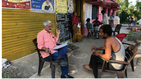
A KHPT team member interviews a local chakki owner

The Principal Secretary, Food, Civil Supplies and Consumer Protection, Madhya Pradesh, is keen to take wheat flour fortification forward in the state. In the first week of October, he suggested that KHPT carry out three activities