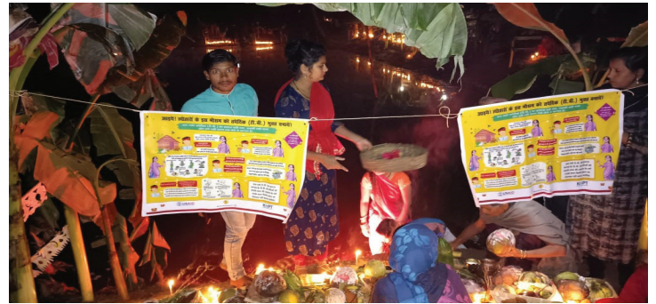
TB IEC on display at the ghats during Chhath puja in Bihar

In Bhagalpur and West Champaran, Bihar , the BTB team oriented school students and teachers on symptoms of TB and its treatment, and conducted oath-taking ceremonies. The team covered 17 schools and 2500 participants across West Champaran and 12 schools and 1858 children in Bhagalpur in November. The team also conducted awareness sessions at the river ghats where Chhath Puja is marked, reaching out about 1.5 lakh persons across the three intervention districts with information on TB symptoms, testing and available government schemes for patients. In West Champaran , community structures involved the participation of 28 TB Champions, who spoke about their experiences with stigma at events in 17 villages in 8 intervention TUs.