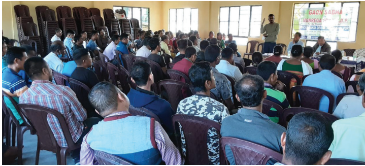
Sensitization of Panchayat members at the Village Council Development Committee meeting in Baksa

As part of Jan Andolan activities, 11 intensive Active Case Finding camps were conducted in three intervention districts to create awareness on TB, in collaboration with the NTEP, community structures and TB Champions. During these camps, around 750 persons were screened, 28 were referred and 2 tested positive for TB.