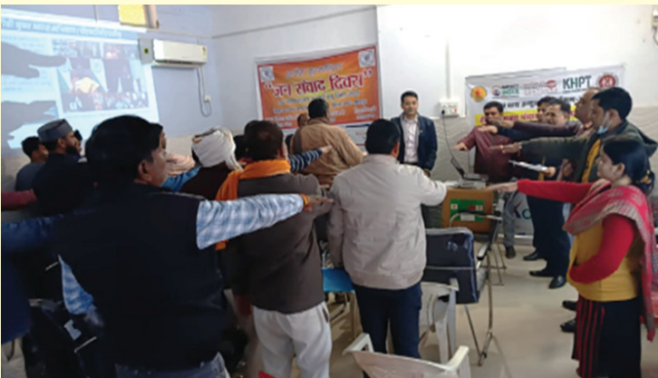
■ TB Pledge event during PRI training in Unnao, Uttar Pradesh

KHPT also conducted PRI representative training sessions in Unnao, Chirang, Muzaffarpur, and Karimnagar, using a PRI Training Module developed in collaboration with CTD. Over 400 Gram Panchayat representatives were trained at the block level in this quarter.