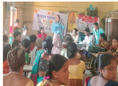
■ Awareness meeting in progress at Kadamtola Jonaki ME School, Assam

Development Committee (VCDC), Assam. The Territorial Council Level Coordination Committee (TCLCC) Chairperson, school teachers, the School Managing Committee, Matri Got (Mothers Group), parents, and community members attended the event. Health talks on TB and NCD followed by NCD screenings for 50 individuals and TB screenings for 22 people.