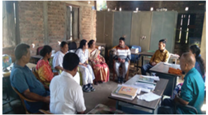
Meeting in progress in Chakadal High school to address nutrition concerns among school students, Baksa, Assam

The next steps include piloting the program for three months, securing local support for long-term implementation, and integrating health talks and nutrition counselling. KHPT also plans to advocate for monthly satellite clinics by AAM for health screenings and monitoring of BMI and haemoglobin levels in the district.