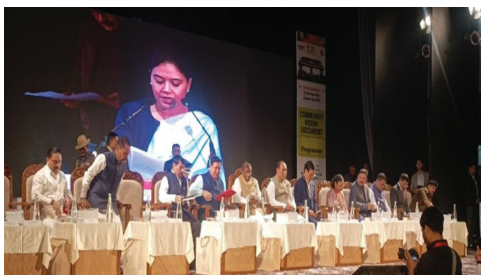
■ Dignitaries at the launch event of the Vision Document for 26 ethnic groups and tribes in Bodoland, Assam

KHPT facilitated the event, ensuring that community members were engaged and that health awareness was raised. Ni-kshay Poshan Kits were distributed to people with TB and caregivers, in line with the PMTBMBA initiative.