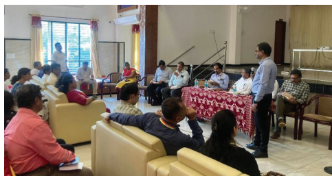
■ Second task force meeting for community palliative care initiative ongoing with representatives of RDPR and Health, Udupi, Karnataka

The second Task Force meeting for the Community Palliative Care (CPC) initiative was held on November 5 in Vandse, Udupi, Karnataka. The meeting brought together the