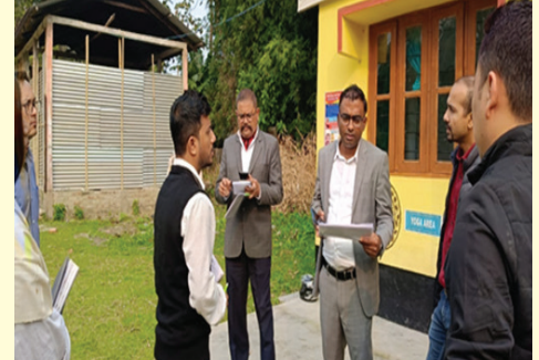
■ Principal Secretary and DC in conversation with the BTB team, Assam